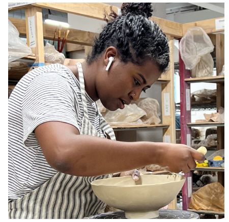
STUDIO ACCESS STUDENT

Pottery Northwest, one of the nation's leading non-profit ceramic studios, has provided top-tier educational programs for 58 years. Artists from around the world come to elevate their skills at our studio in the spirit of artistic dialogue and as a cruicial formative step in their artistic careers.