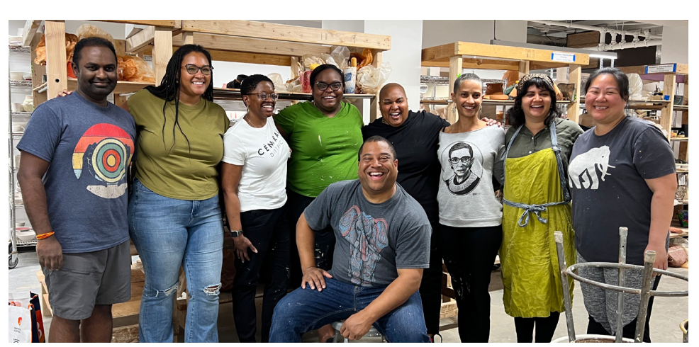
URBAN LEAGUE STUDIO CLAY EVENT