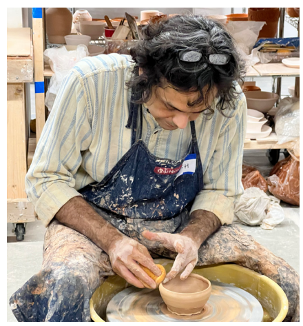
INSTUCTOR FOR A HOLIUDAY TEEN CLAY EVENT