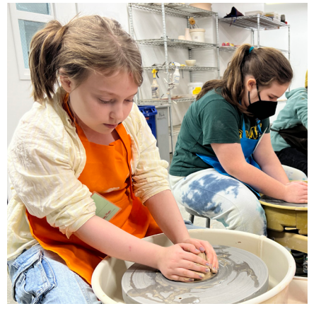
ELEMENTARY SCHOOL STUDIO VISIT